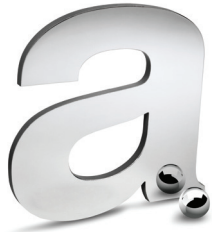
Mirror Polish (Up to 24")

Aluminum alloy 5052 is offered because of its strength, corrosion resistance and value. Aluminum presents a naturally beautiful luster regardless of the finish chosen. Some of the most popular options include satin, mirror polish, paint or powder coat. Natural aluminum is protected with weatherometer proven, clear interior lacquer or exterior powder coat.