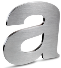
Satinbrite™ Face & Polished Sides