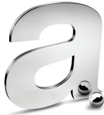
Edgeblend™ (Up to 24")