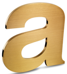
Satinbrite™ Face & Polished Sides