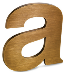
Medium Oxidized Satin Brushed