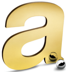
Mirror Polish (Up to 24")

Brass alloy 280 provides a distinguished gold appearance. Virtually all available finishes offer a warm architectural look in interior applications, while shades of oxidation perform well in both the interior and exterior. All brass solid cut letters have a protective clear coat.