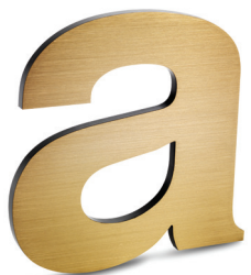
Satinbrite™ Face & Painted Sides