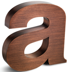
Medium Oxidized Satin Brushed