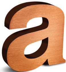
Satinbrite™ Face & Painted Sides