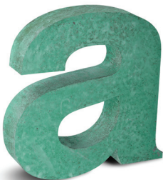
Verde Green Patina