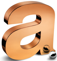
Mirror Polish (Up to 24")

Copper alloy 110 provides a distinguished reddish appearance. Virtually all available finishes offer a warm architectural look in interior applications, while shades of oxidation perform well in both the interior and exterior. All copper fabricated letters have a protective clear coat.