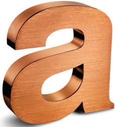
Satinbrite™ Face & Polished Sides