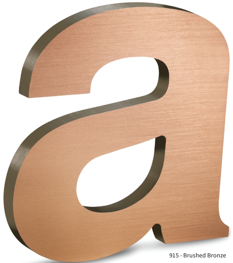
915 - Brushed Bronze

View the entire Chemetal™ list offerings: www.Chemetal.com