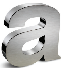
Satinbrite™ Face & Polished Sides