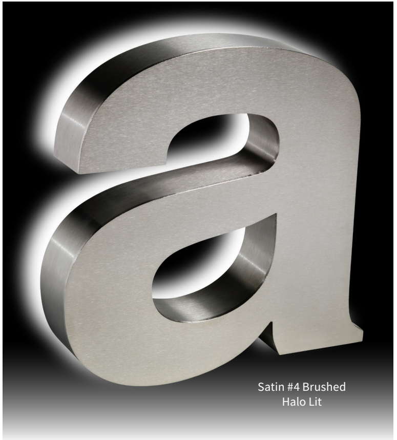
Satin #4 Brushed Halo Lit