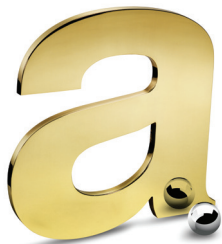
Edgeblend™ (Up to 24")