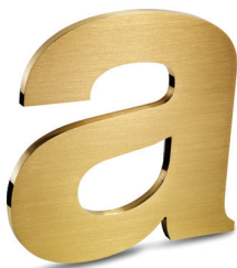
Satinbrite™ Face & Polished Sides