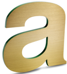
Satinbrite™ Face & Painted Sides