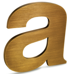
Medium Oxidized Satin Brushed